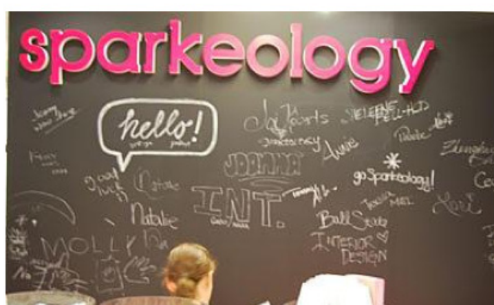
Sparkeology's booth at #NeoCon10.