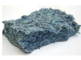
Green Jean Insulation by Bonded Logic Inc